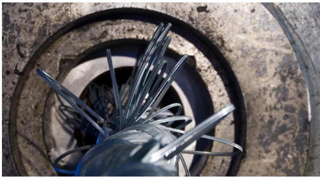
DMT Rope Testing